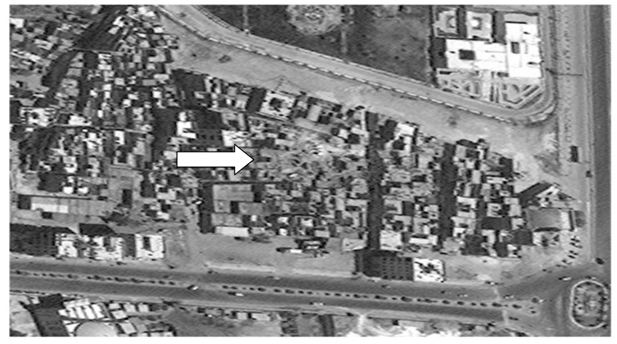
Digital Globe World View 1 – 27 July