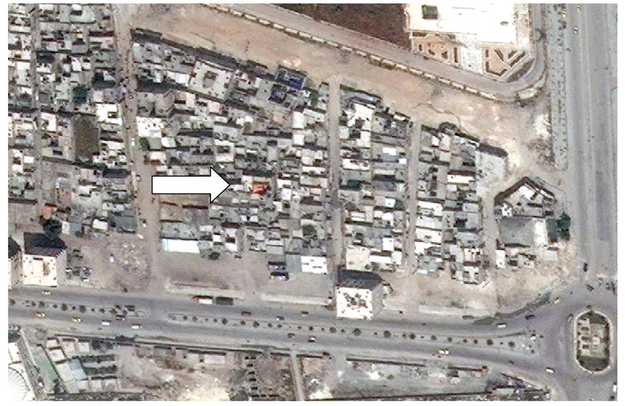
Digital Globe World View 1 – 13 May