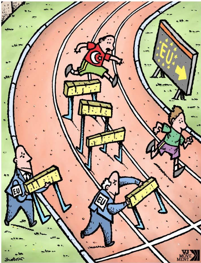
Cartoon Movement: https://www.cartoonmovement.com/collection/77