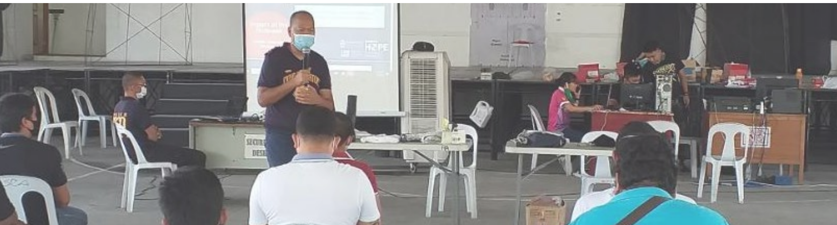
Photo: A Secondary cascade training being conducted in the Philippines in April 2020

Designed as a Training-of-Trainers (TOT) program for widespread replication, participants who have completed the training receive all training materials and are provided with support to train others in their network. On average, every individual that has completed the TOT has gone on to train an additional 25 individuals within their home country. This new cadre of trainers have the flexibility to adapt the training based on the secondary audience's needs. In addition to the direct, virtual training delivered by Brown University, the training curriculum has also been made available online so that individuals, providers, and health facilities worldwide can freely access the content and quickly benefit from the curriculum.