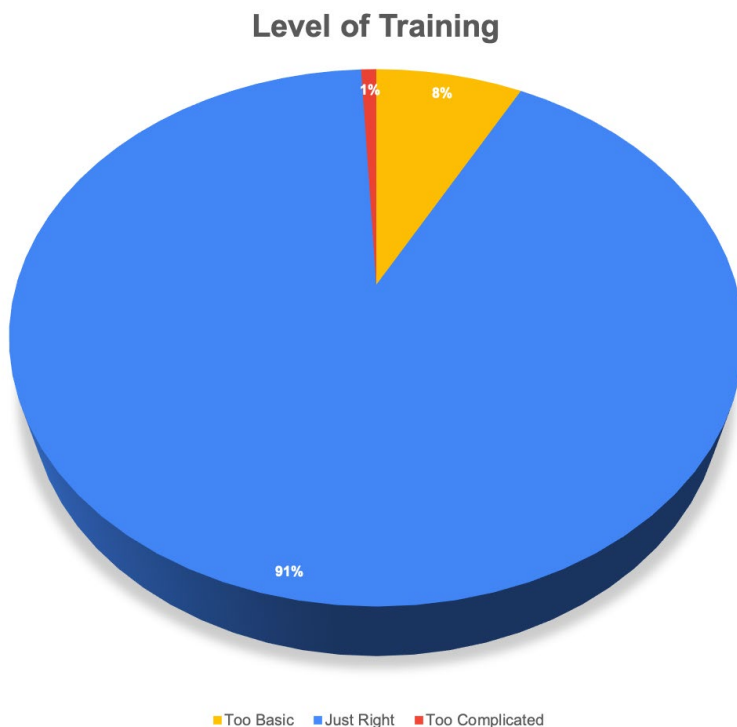
Figure 2: Level of Training. Participant's feedback from all countries on the appropriateness of the level of training provided in the Training of Trainers Program.