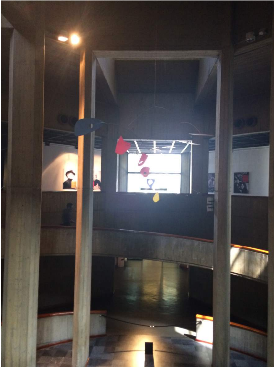
Image 4: Tehran Museum of Contemporary Art, Main Staircase