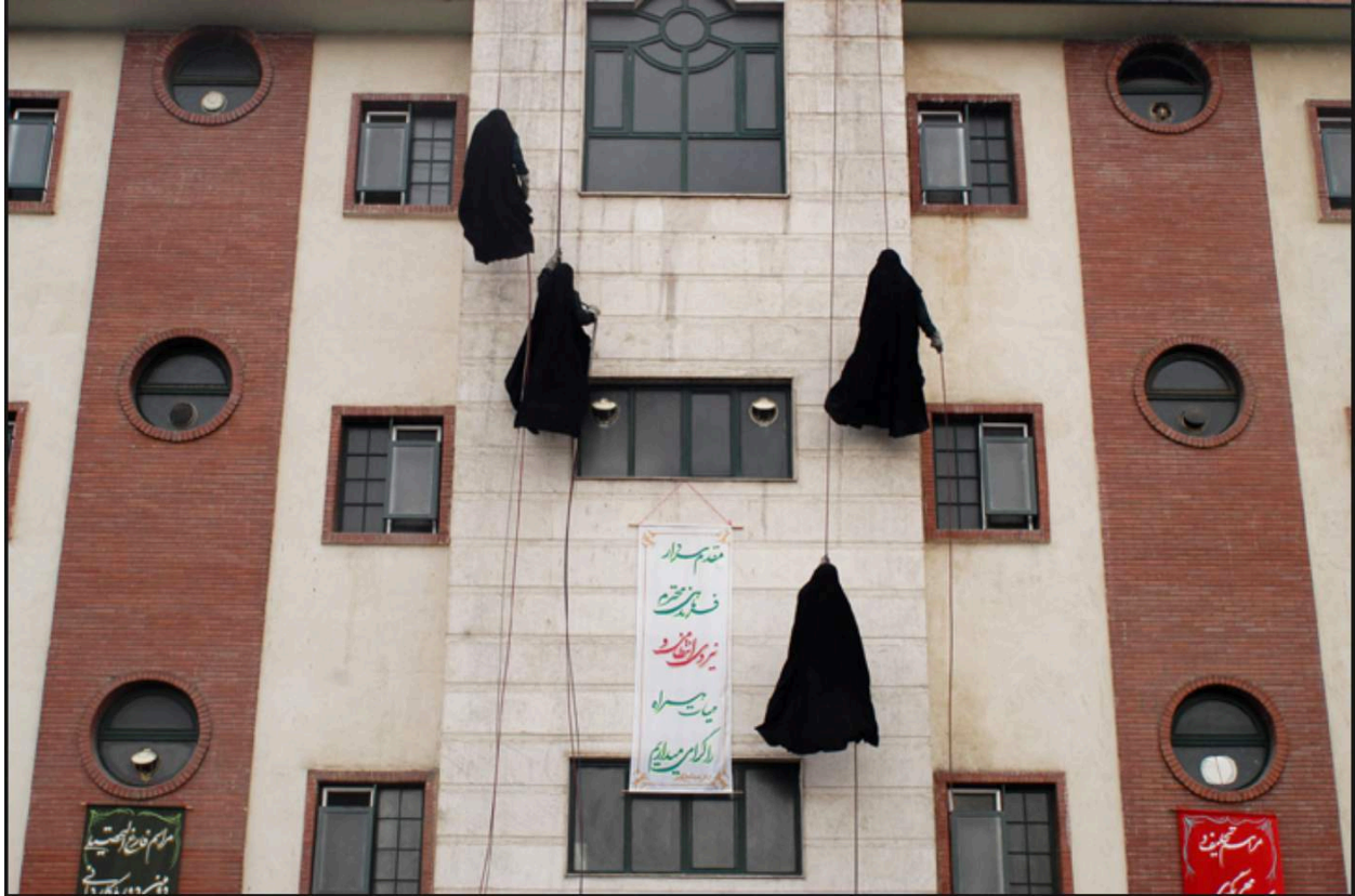
Image 16: Abbas Kowsari, Shade of Earth (2008)