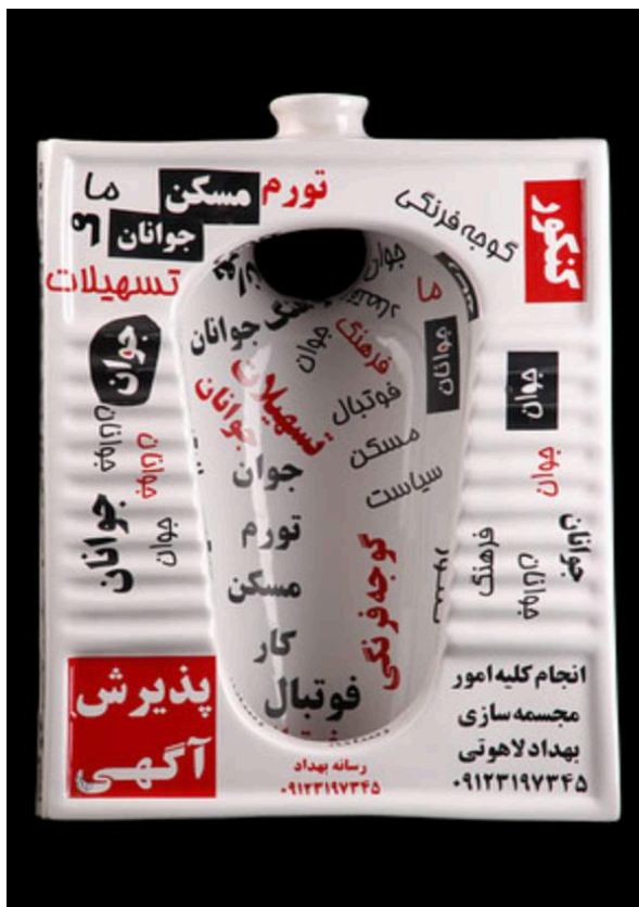
Image 13: Behdad Lahooti, A Cliché for Mass Media (2008)