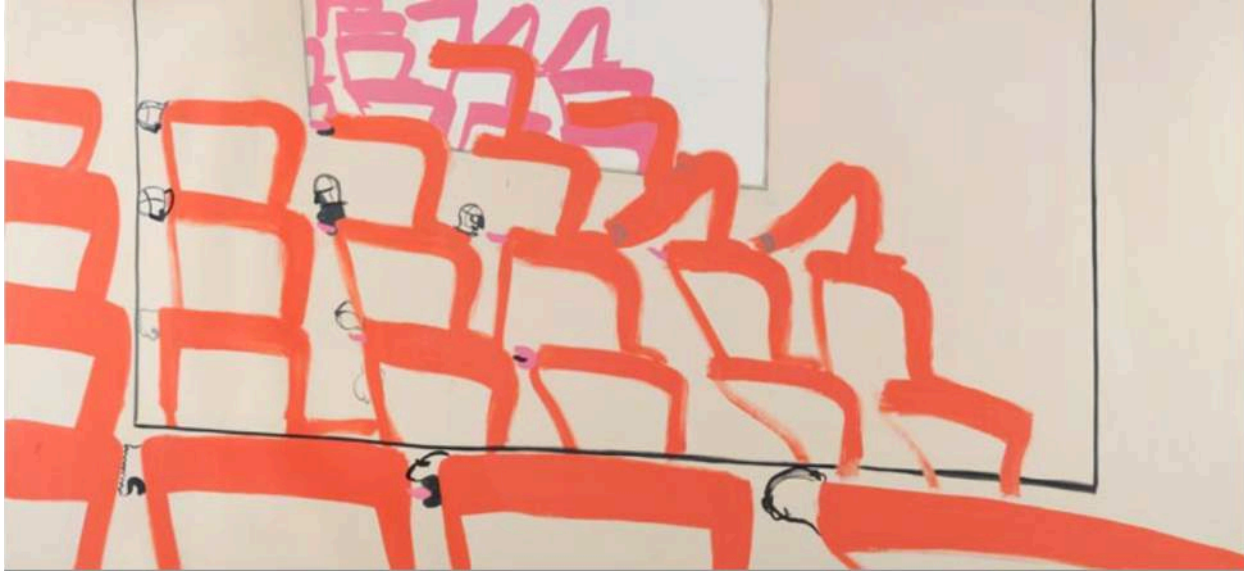
Image 12: Tala Madani, Tower Reflections (2006)