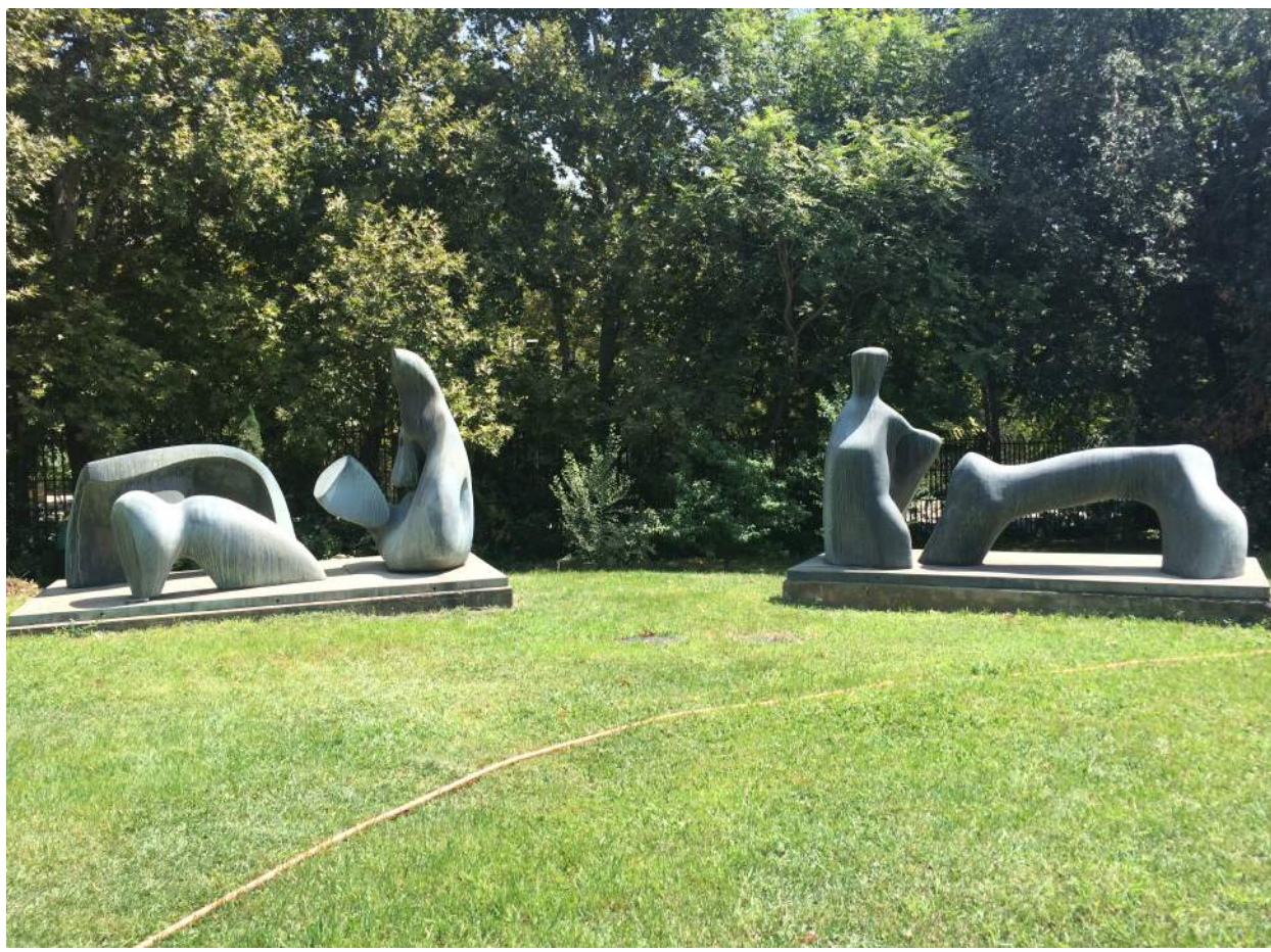
Image 5: Henry Moore in TMOCA Sculpture Garden