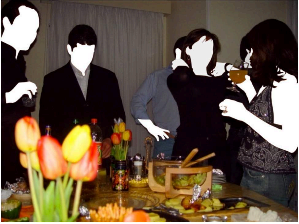
Image 1: Tehran Remixed (2005) by Amir Ali Ghassemi