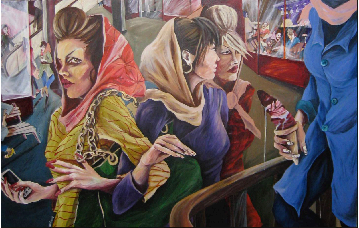
Image 18: Saghar Daeeri, Shopping Malls of Tehran (2008) Source: Artist's Website