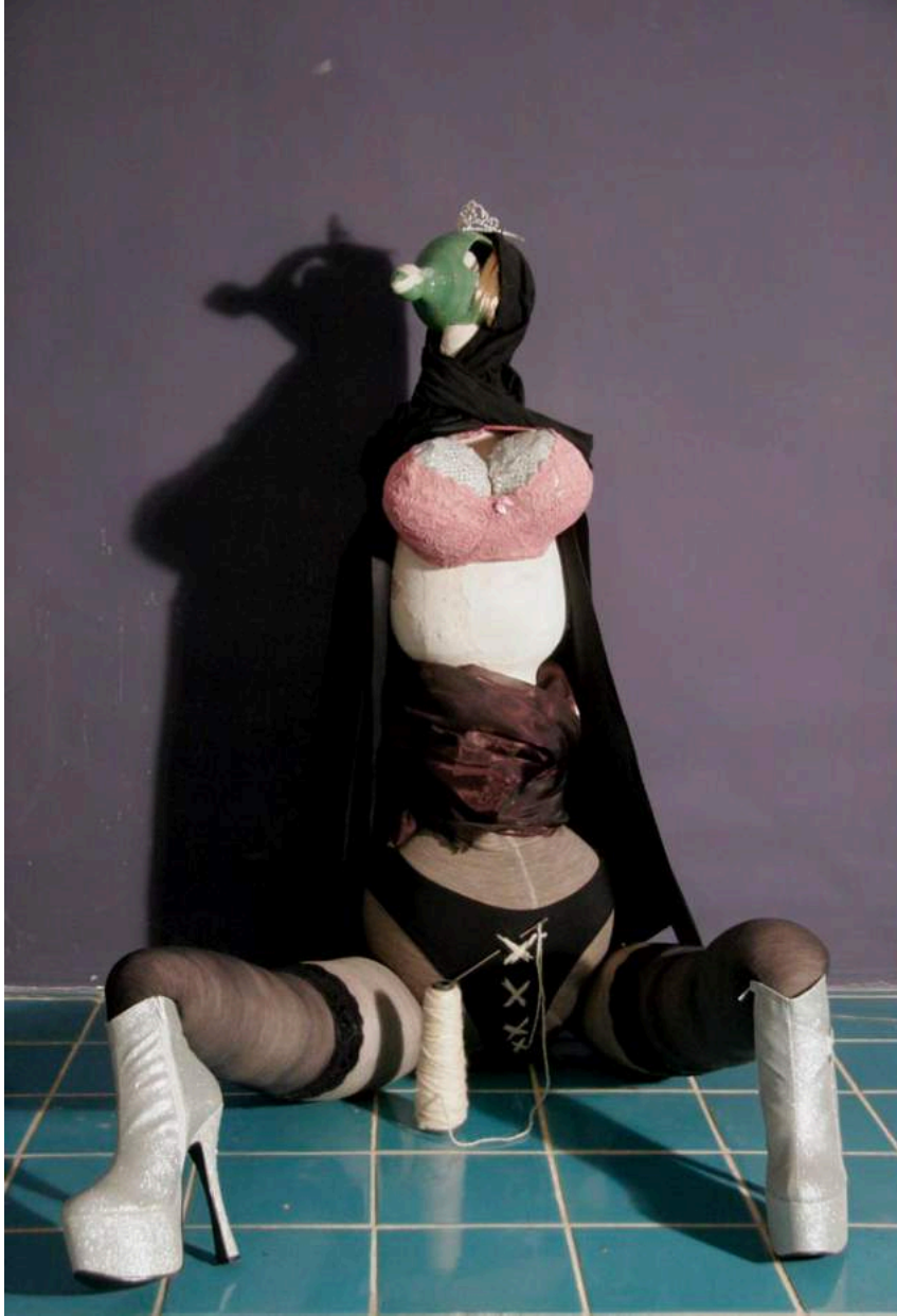
Image 10: Shirin Fakhim, Tehran Prostitutes (2008)