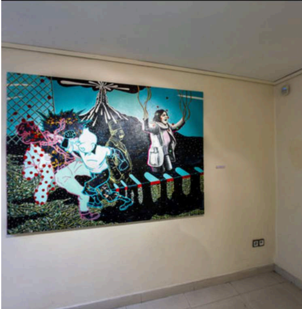
Image 8: Behrang Samadzadeghan, Strong Fist (2013)