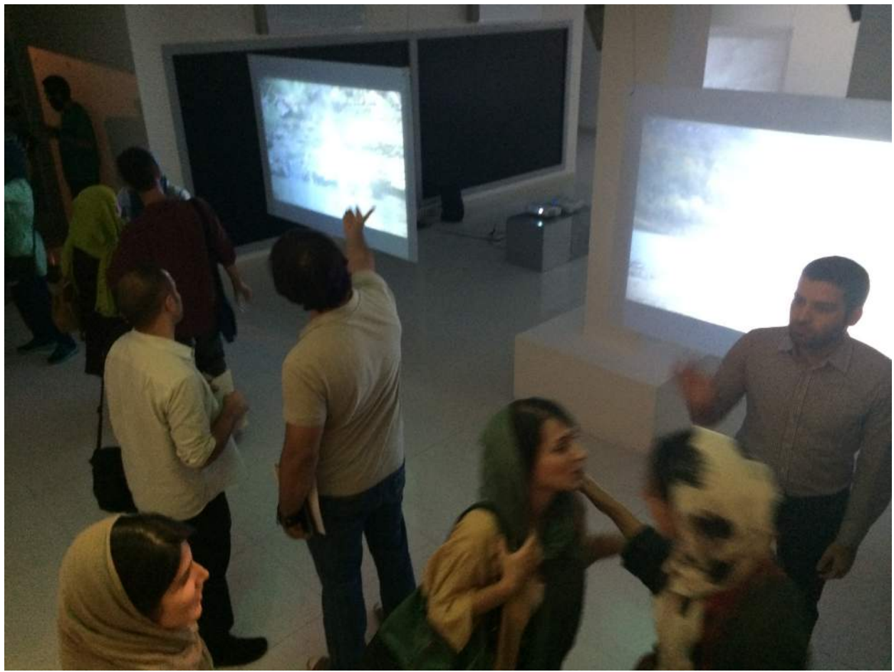
Image 3: Aaran Gallery Opening, August 2014