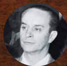
PRESIDENT JACOBO ARBENZ GUATEMALA

CIA ACTION: Overthrown by CIA-backed military coup, 1953. Restored the Peacock Throne of the Shah that lasted until 1978.