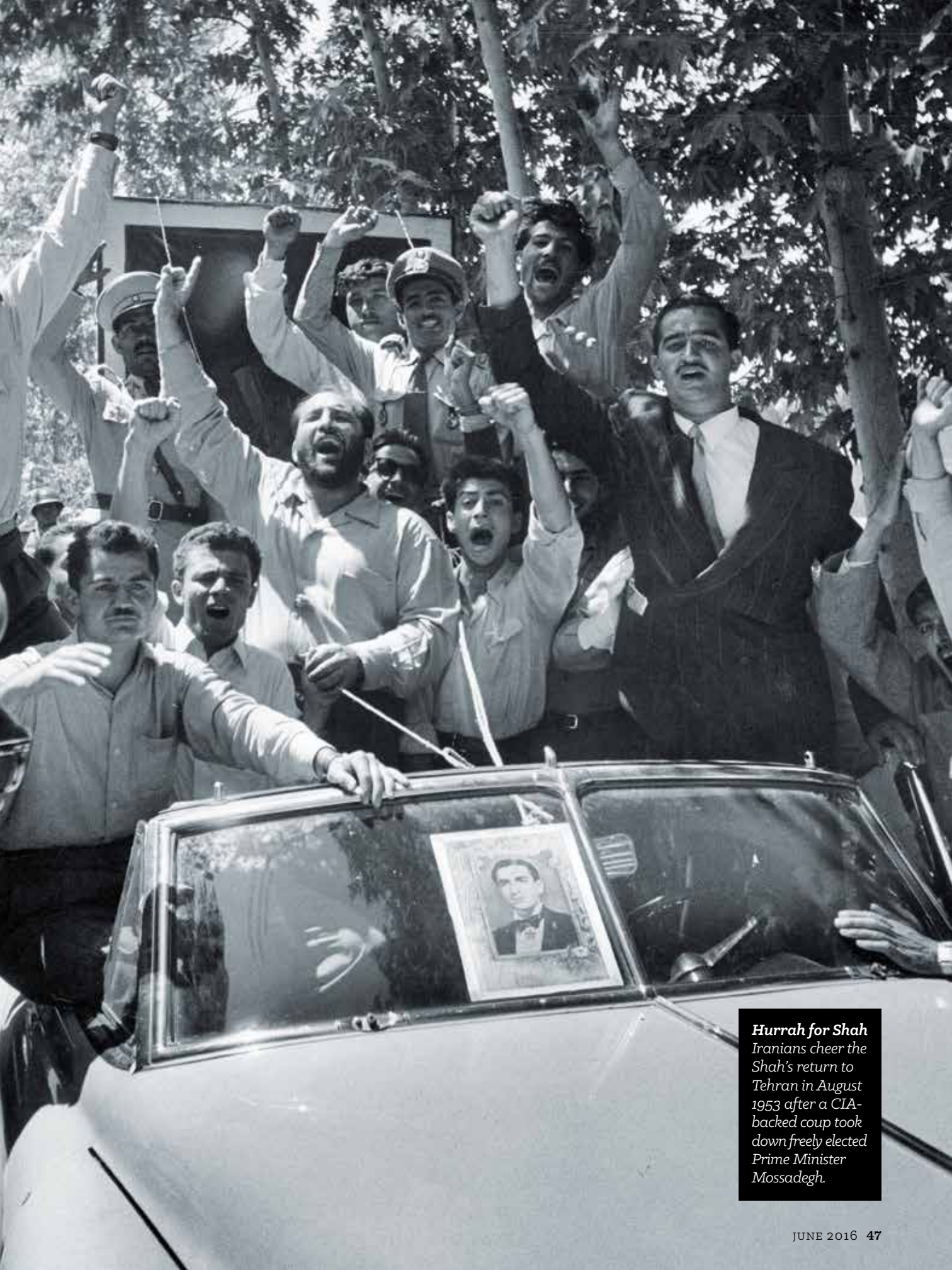
Hurrah for Shah Iranians cheer the Shah's return to Tehran in August 1953 after a CIA-backed coup took down freely elected Prime Minister Mossadegh.