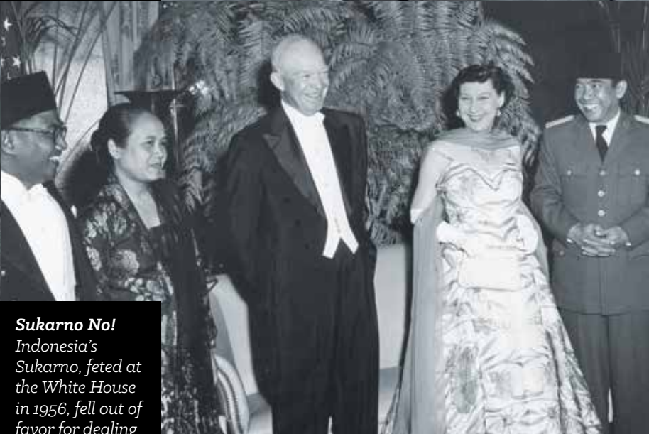
Sukarno No! Indonesia's Sukarno, feted at the White House in 1956, fell out of favor for dealing with Soviet leader Khrushchev.