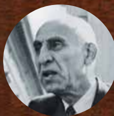
PRIME MINISTER MOHAMMAD MOSSADEGH IRAN

To counter Soviet influence and kill nationalist movements that might hurt U.S. economic interests, the CIA put many leaders in their cross hairs