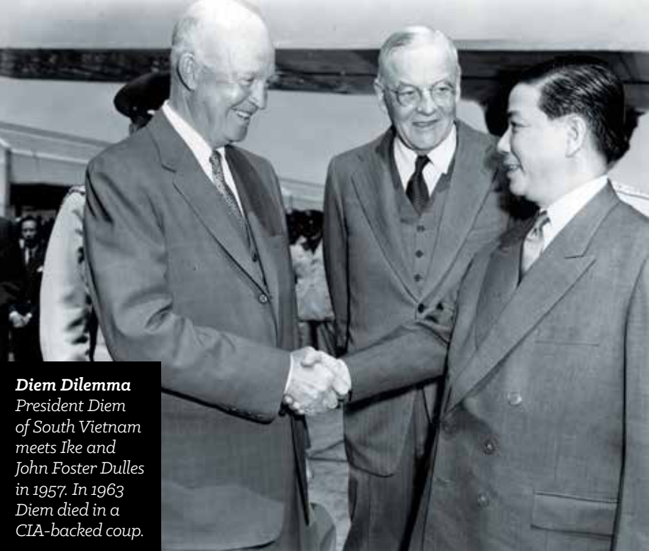
Diem Dilemma President Diem of South Vietnam meets Ike and John Foster Dulles in 1957. In 1963 Diem died in a CIA-backed coup.